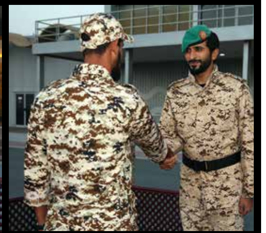
Supreme Council for Youth & Sport Chairman, Bahrain Olympic Committee President & Royal Charity Organisation (RCO) Chairman HH Shaikh Nasser bin Hamad Al Khalifa received at Sakhir Air Base yesterday a BDF task force taking part in the "Restore Hope Operation" in Yemen as part of the Saudi-led Arab coalition. The Commander hailed their dedicated efforts in performing their sacred national duty and praised bravery and sacrifice of the task force members yesterday at the Gudaibiya Palace