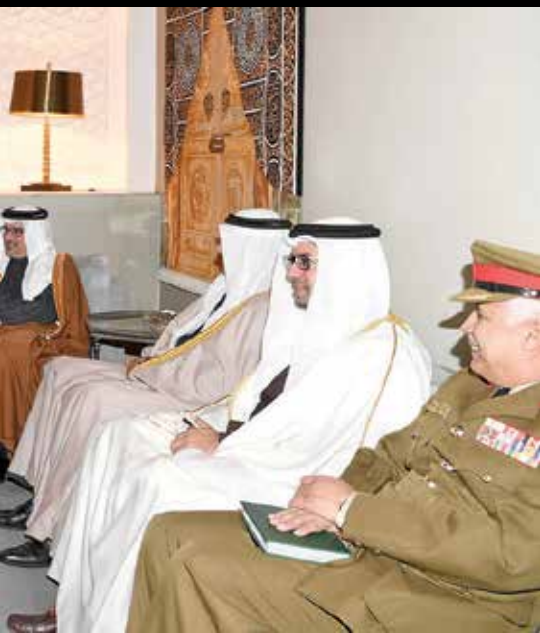
Crown Prince, Deputy Supreme Commander and First Deputy Prime Minister HRH Prince Salman bin Hamad Al Khalifa yesterday met with General (Ret) Gregory S. Martin along with students of the United States National Defence University (USNDU) participating in the CAPSTONE Course, at Riffa Palace. During the meeting, Prince Salman stressed the Kingdom's longstanding commitment to educational excellence and specialised training in various fields