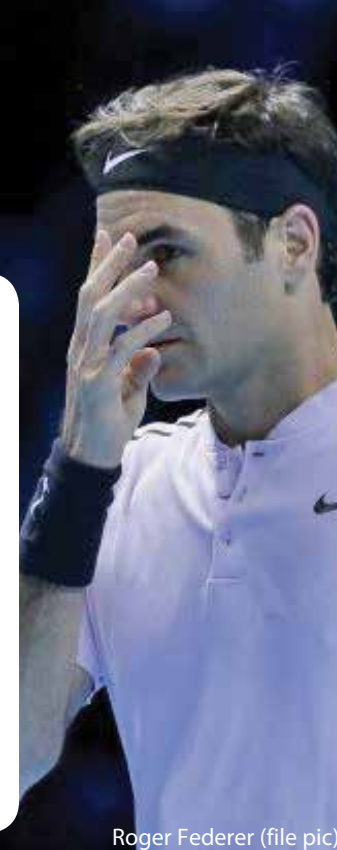
Roger Federer (file pic)

A surprisingly flat Federer could not muster another challenge as Goffin served out in style to reach the biggest final of his career and guarantee a new champion on today night. (BBC)