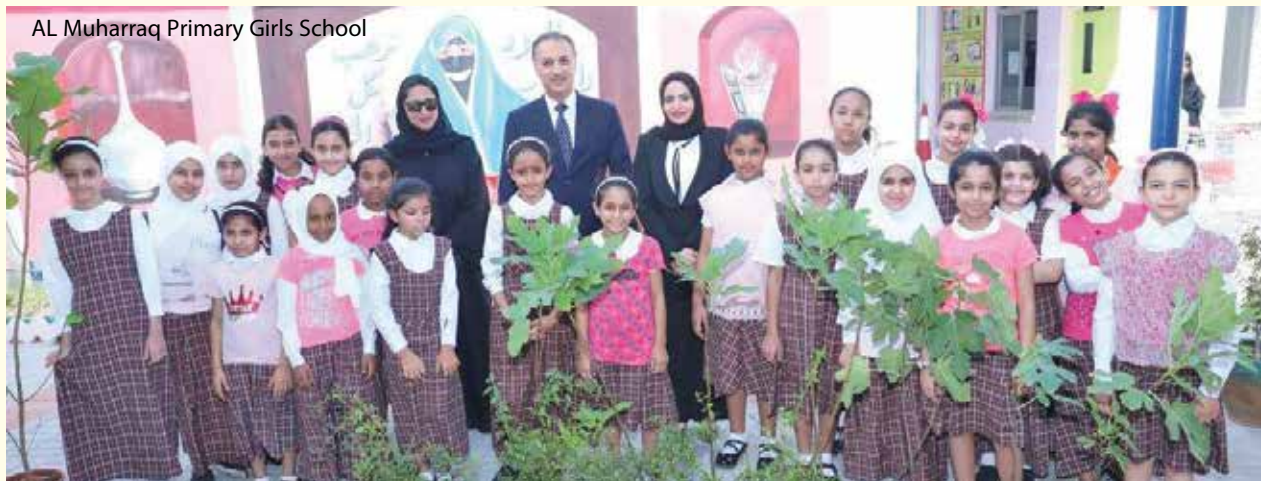
AL Muharraq Primary Girls School

He said GPIC has always supported this annual event in cooperation with the Ministry of Education since