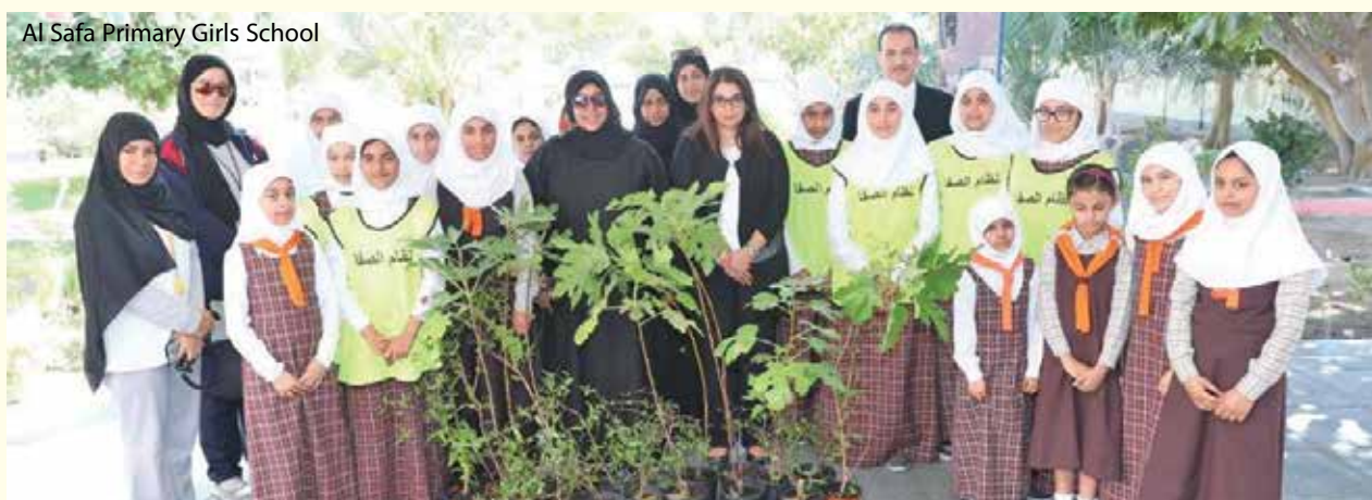
Al Safa Primary Girls School

schools are the ideal place for young people to familiarize themselves with the need and the importance of caring for the environment, and how to plant trees as well as generate an interest in increasing green