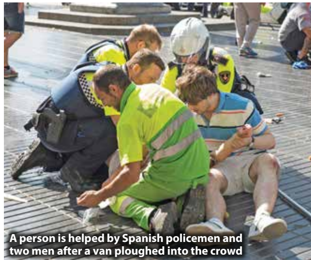
A person is helped by Spanish policemen and two men after a van ploughed into the crowd