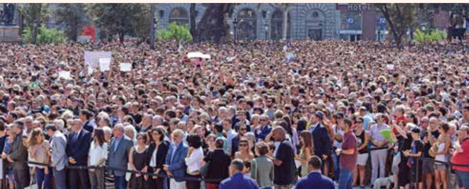
People wait before a minute of silence for the victims of the Barcelona attack at Plaza de Catalunya

They lay on the ground, without knowing what was going on, before they were eventually allowed to leave and walked back to their hostel.