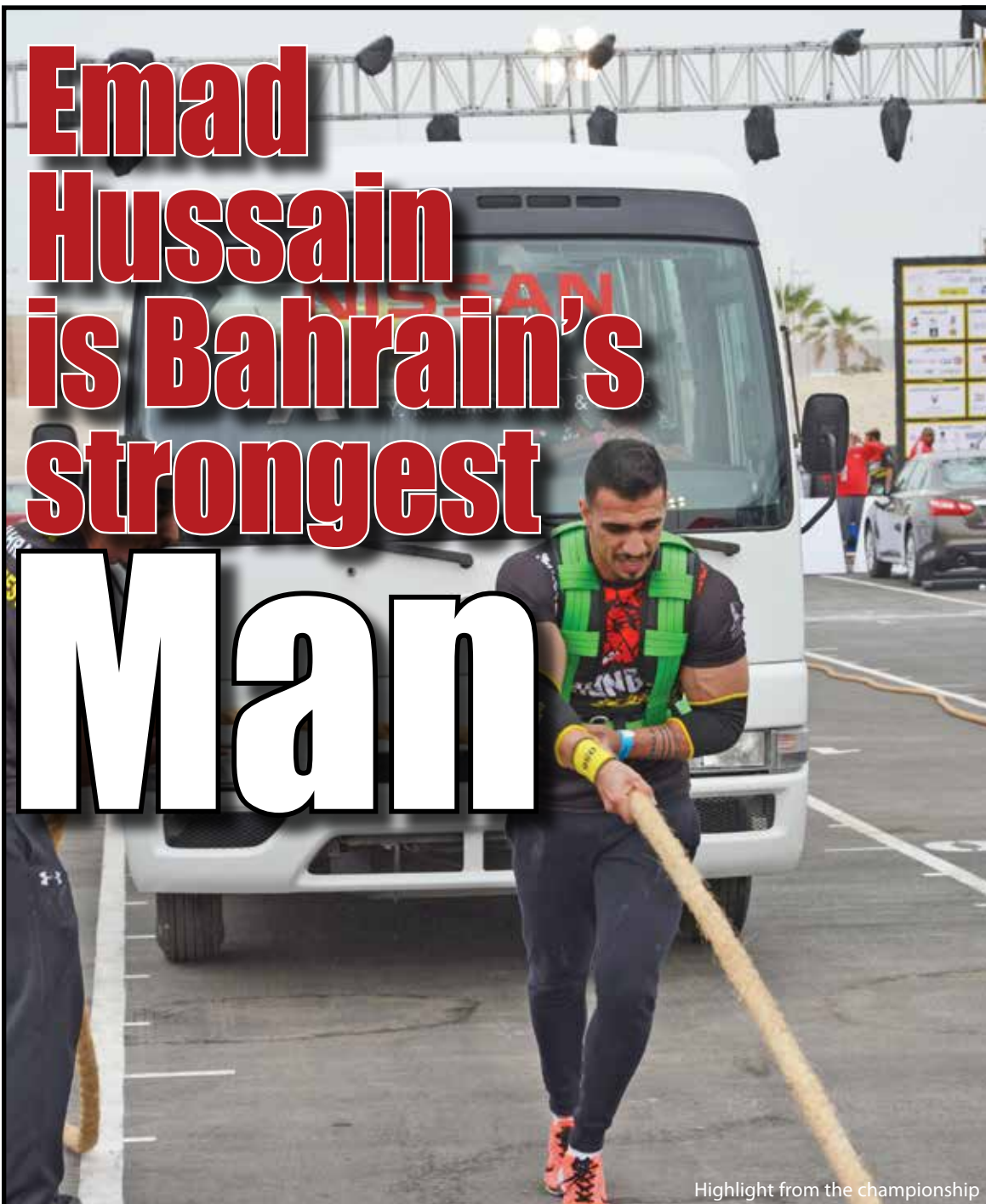
Highlight from the championship