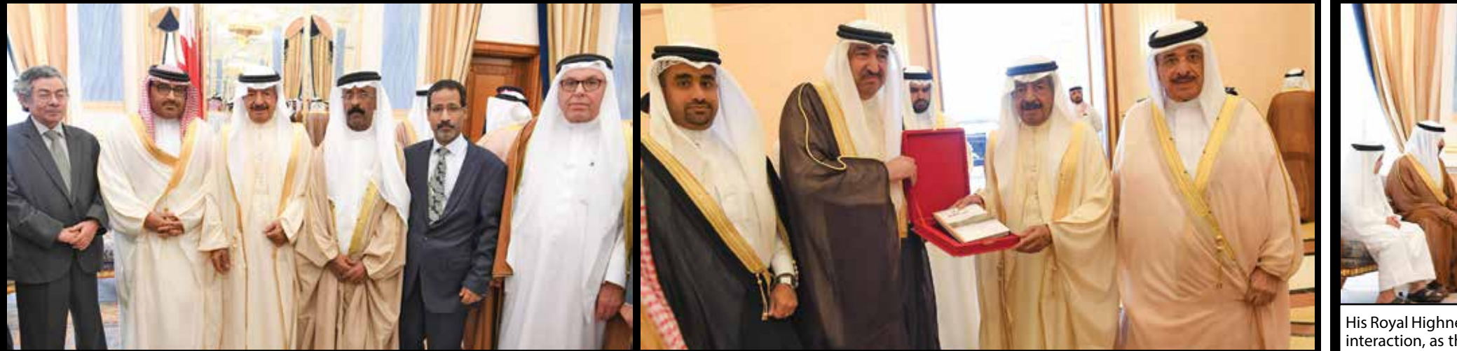
His Royal Highness Prime Minister Prince Khalifa bin Salman Al Khalifa received at Gudaibiya Palace yesterday a number of senior officials, members of the legislative branch, the Intelligentsia, journalists, media persons and citizens.