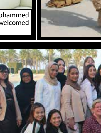
Female employees at KPMG in Bahrain atte (IWD). During the event held at the La Plage bution to the firm's growth. Attendees also h key hurdles women often face today.