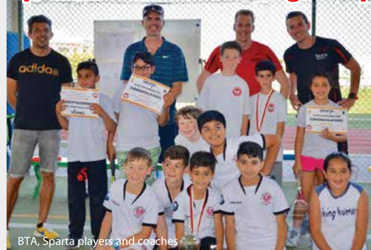
BTA, Sparta players and coaches