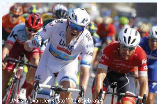
UAE's Alexander Kristoff (L) celebrates

I'm very happy how the team raced and brought me to the front and that I was able to finish it off. It's important to win and I was the first win with my new team so I'm very happy." (Cyclingnews)