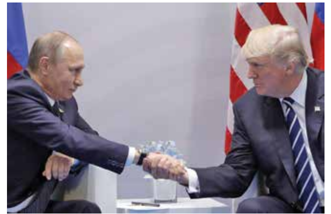
U.S. President Donald Trump shakes hands with Russian President Vladimir Putin during their bilateral meeting at the G20 summit in Hamburg

It said its initial funding came largely at the request of the former Senate leader Harry Reid, the Nevada Democrat long known for his enthusiasm for space phenomena. He was quoted as saying: "I'm not embarrassed or ashamed or sorry I got this thing going. I think it's one of the good things I did in my congressional service. I've done something that no one has done before." ( The Guardian )