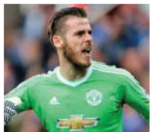
David De Gea