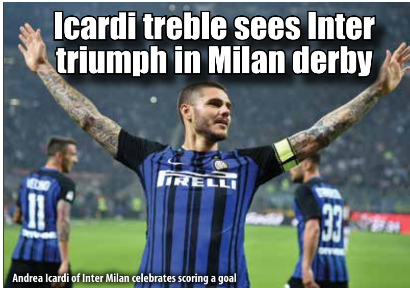
Andrea Icardi of Inter Milan celebrates scoring a goal