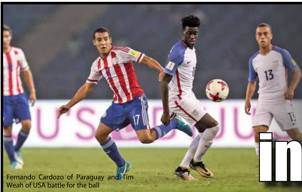
Fernando Cardozo of Paraguay and Tim Weah of USA battle for the ball