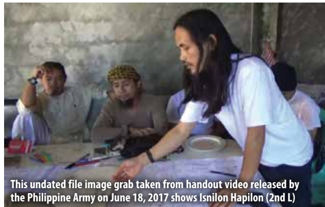
This undated file image grab taken from handout video released by the Philippine Army on June 18, 2017 shows Isnlon Hapilon (2nd L)

"(Our troops) were able to get Isnlon Hapilon and Omar Maute. They were both killed," Defence Secretary Delfin Lorenzana told reporters, referring to another fighter who led the attack with Hapilon on the southern Philippines city of Marawi city in May. The US