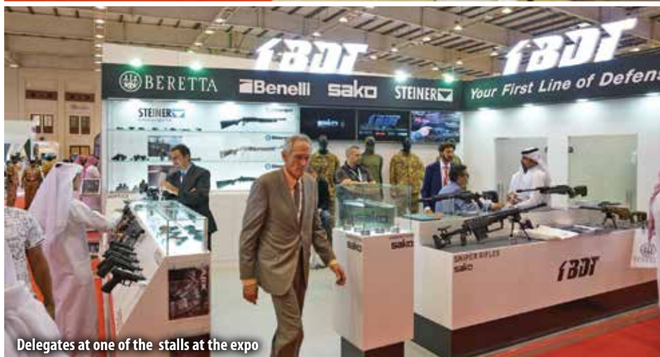
Delegates at one of the stalls at the expo