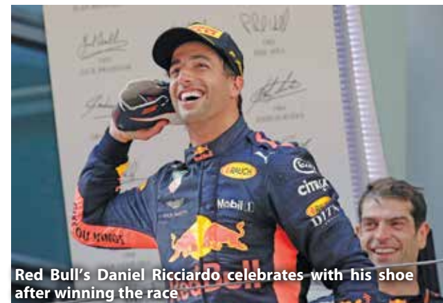
Red Bull's Daniel Ricciardo celebrates with his shoe after winning the race

"Barcelona's season is tremendous," Simeone said. "We will try to get closer to them and if we can't get closer, we will congratulate them." (AFP)