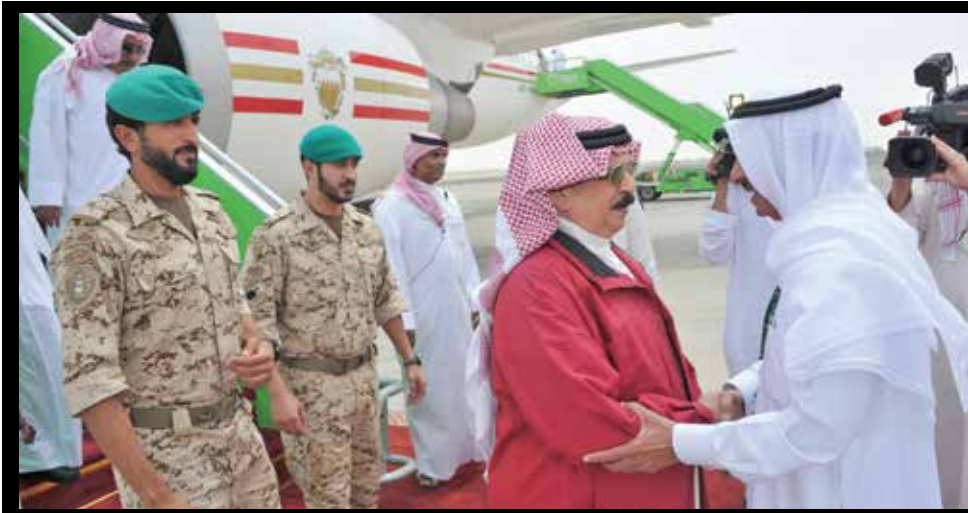
His Majesty King Hamad bin Isa Al Khalifa returned to Bahrain from Saudi Arabia after attending the conclusion of the Joint Gulf Shield 1 military exercise held with the participation of Bahrain Defence Force. HM the King sent a cable of appreciation to the Custodian of the Two Holy Mosques King Salman bin Abdulaziz Al Saud for the warm welcome and generous hospitality shown during the 29th Arab League Summit and the Joint Gulf Shield 1.