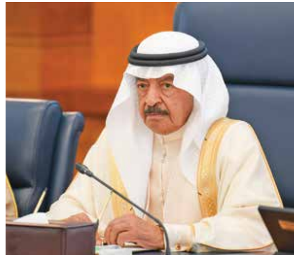
HRH Prime Minister Prince Khalifa bin Salman Al Khalifa

The Cabinet also discussed two proposals submitted by the Council of Representatives on postponing housing instalments, and allocating land lot for services and facilities in Hamad Town, and approved the government's replies to them, as recommended by the Ministerial Committee for Legal Affairs, and presented by the Deputy Premier and committee chairman.