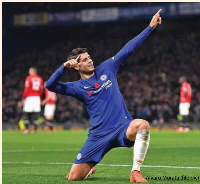
Alvaro Morata (file pic)