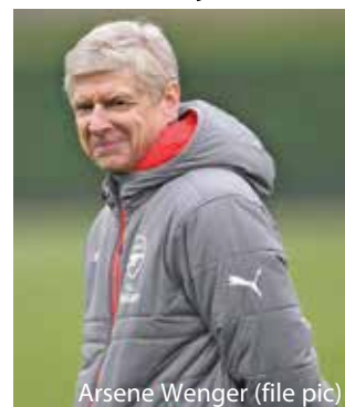
Arsene Wenger (file pic)

Jack Wilshere is another player whose Arsenal contract