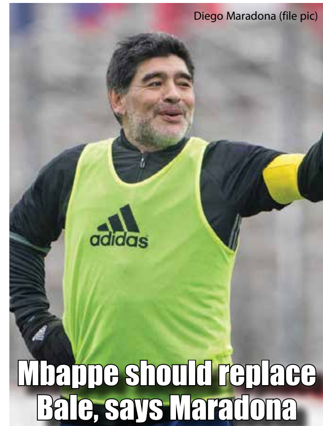
Diego Maradona (file pic)

Since returning the Everton in the summer after 13 years at Old Trafford, Rooney has scored nine goals in 15 Premier League appearances, including five in his last four games. ( espn.in )