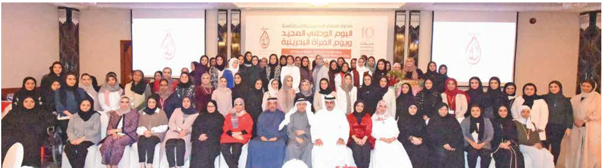
Group's female staff members are pictured with Executive Management at the ceremony on the occasion of Bahraini Women Day and Bahrain National Day