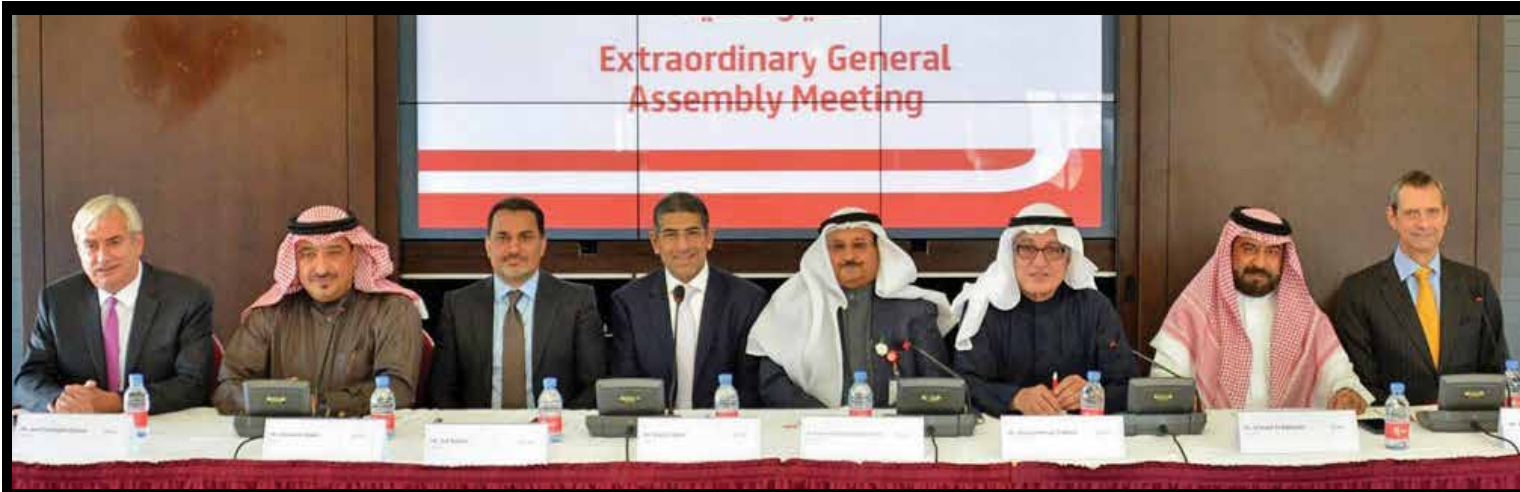
Batelco yesterday held an EGM (Extra-Ordinary General Meeting) to discuss proposed changes to Batelco's Memorandum and Articles of Association. The meeting, held at Batelco's Hamala headquarters was attended by Shareholders, Company Directors and Batelco management