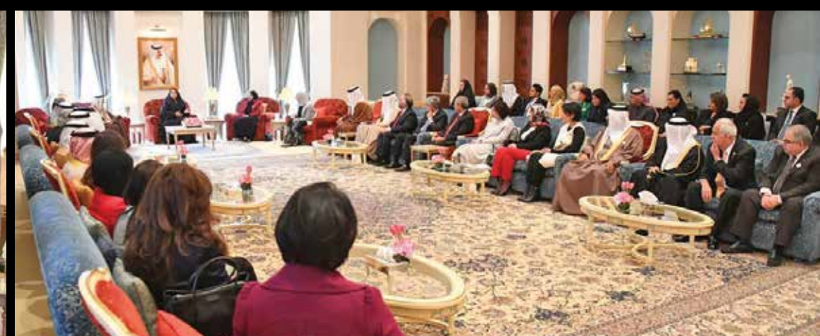
HRH Princess Sabeeka bint Ibrahim Al Khalifa, received at SCW headquarters yesterday sponsors of the Bahraini Women's Day "Women in Leadership". HRH Princess Sabeeka was presented with the concluding report on the Bahraini Women's Day 2017 work programme. HRH Princess Sabeeka commended the outgoing Turkish envoy's role in bolstering relations of friendship and cooperation in all fields