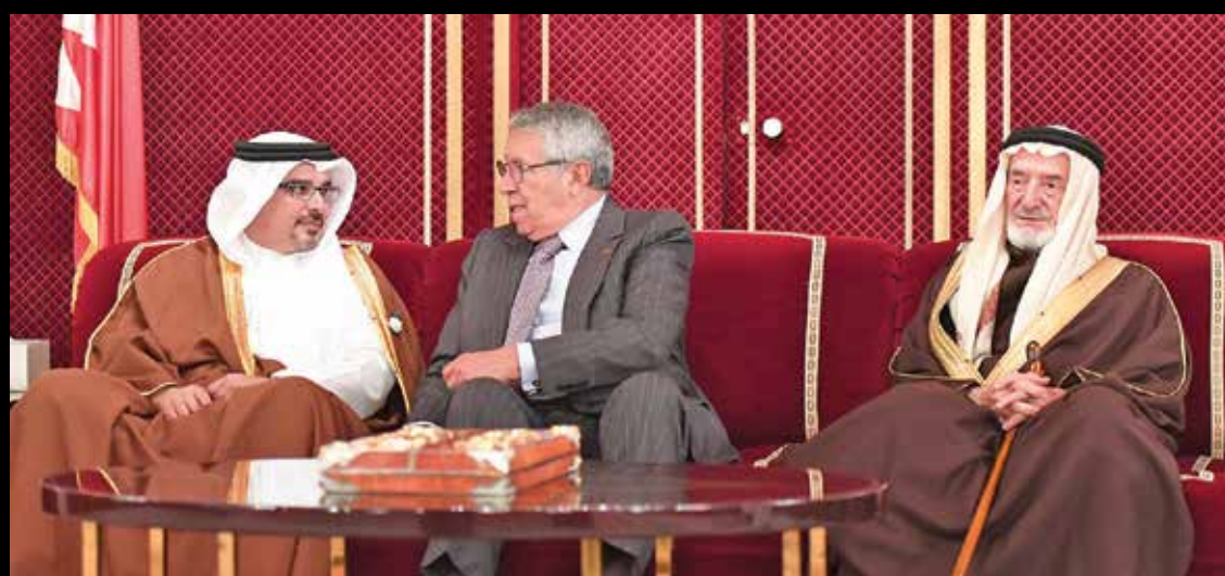
Government officials, members of the Shura Council and Council of Representatives, members of municipal councils, religious and community leaders, journalists, and diplomats attended the Majlis