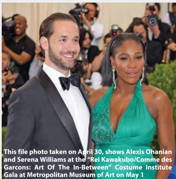
This file photo taken on April 30, shows Alexis Ohanian and Serena Williams at the "Rei Kawakubo/Comme des Garçons: Art Of The In-Between" Costume Institute Gala at Metropolitan Museum of Art on May 1