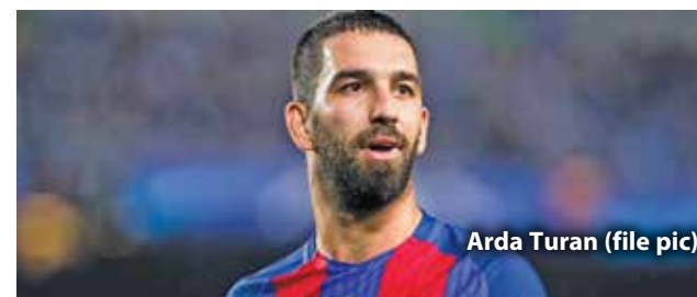
Arda Turan (file pic)

But Real were quick to respond in an entertaining contest and Luka Modric set Ronaldo clear on the right-hand side of the area, only for the Portuguese star to lift the ball over the onrushing Asenjo and wide of the far post. (thesun.co.uk)