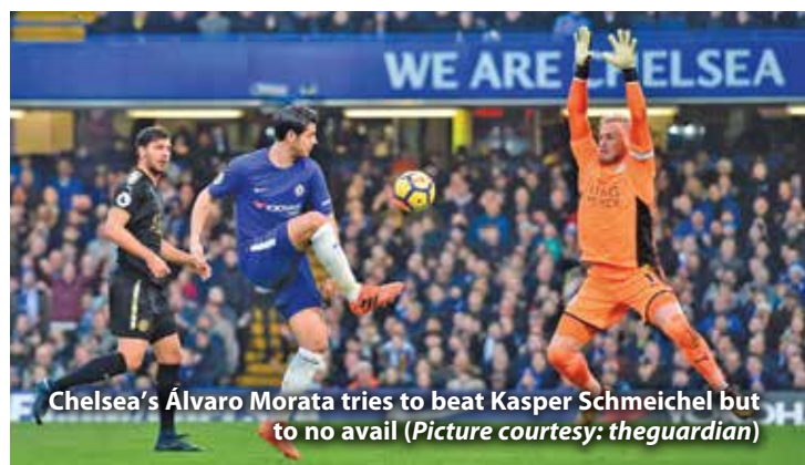
Chelsea's Álvaro Morata tries to beat Kasper Schmeichel but to no avail