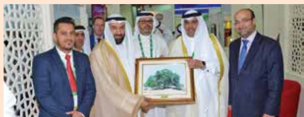
Officials at the event in Kuwait