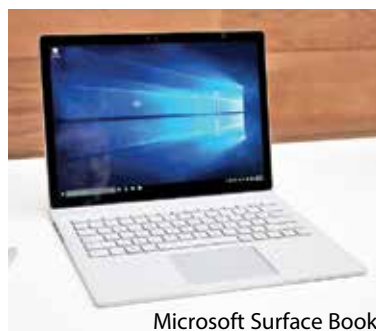
Microsoft Surface Book

weighs 3.34 lbs whereas the MacBook Pro is 3.48 lbs. The slightly bigger Surface Book has more pixel density (267ppi) with a commendable aspect ratio of 3:2. Microsoft also introduces its new PixelSense technology with super responsive touch and stylus controls.