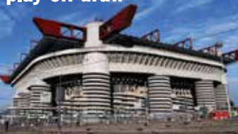
Final: San Siro, Milan