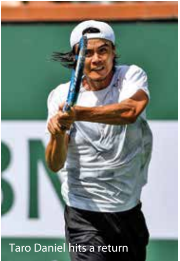
Taro Daniel hits a return

California N ovak Djokovic suffered a shock defeat by world number 109 Taro Daniel of Japan as he was knocked out of the BNP Paribas Open at Indian Wells. The 30-year-old lost 7-6 (7-3) 4-6 6-1 in the second-round tie on his first appearance since an injury ended his Australian Open challenge in January. Djokovic had further surgery on a persistent elbow injury in February. "It felt like first match I ever played on the tour. Very weird. I completely lost rhythm," said the Serb.