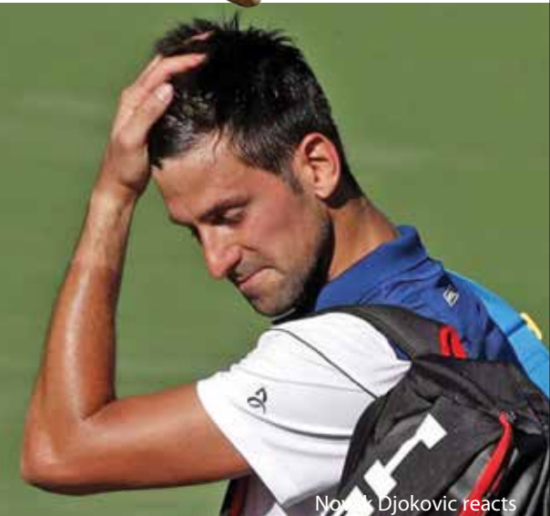
Novak Djokovic reacts