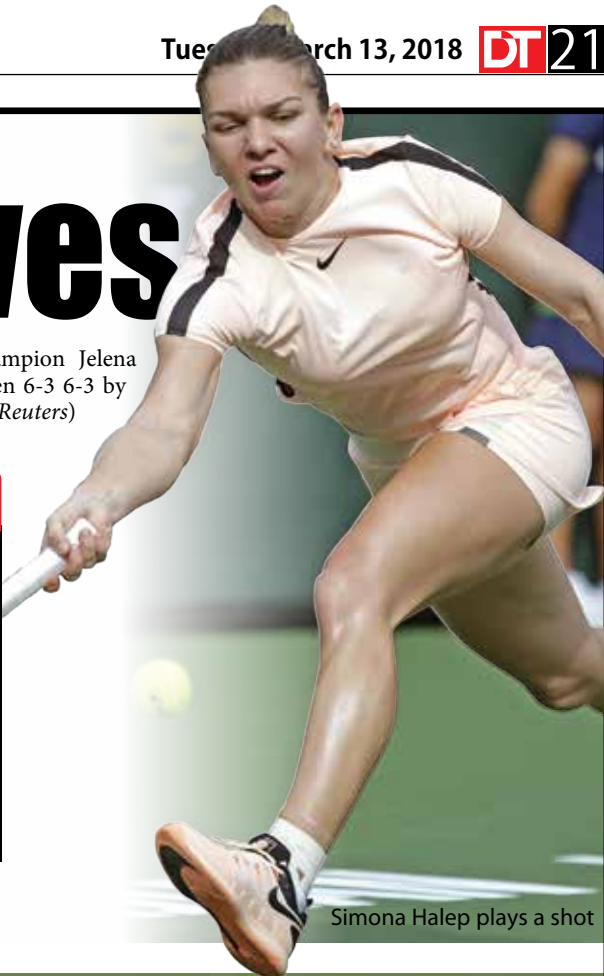
Simona Halep plays a shot

Third round: Simona Halep bt Caroline Dolehide 1-6, 7-6(3), 6-2 Wang Qiang bt Kristina Mladenovic 6-1, 6-2 Marketa Vondrousova bt Aryna Sabalenka 6-2, 6-2 Petra Martic bt Jelena Ostapenko 6-3, 6-3 Maria Sakkari bt Coco Vandeweghe 6-2, 6-4 Amanda Anisimova bt Petra Kvitova 6-2, 6-4 Karolina Pliskova bt Zhang Shuai 7-5, 5-7, 6-3 Second round: Angelique Kerber bt Ekaterina Makarova 3-6, 6-4, 6-2 Sloane Stephens bt Victoria Azarenka 6-1, 7-5. (Xinhua)