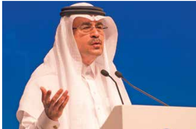
Saudi Aramco CEO Amin Nasser compromised."

"Financial investors are shying away from making much needed investment," he said, warning that without higher investment levels "energy transition and energy security may be fatally