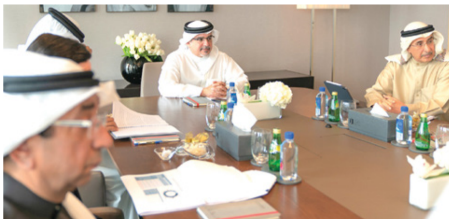
HRH the Crown Prince chairs the meeting.

"I carry in my heart the visit I just made to the UAE and the warm welcome I received," he said.