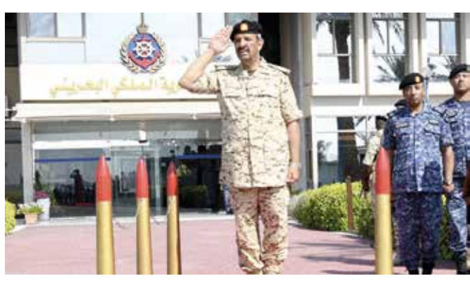
The Commander-in-Chief of the Bahrain Defence Force (BDF), Field Marshal Shaikh Khalifa bin Ahmed Al Khalifa, during an inspection visit to one of the BDF units. The commander-in-chief gave directives to continue implementing various training programmes to achieve the highest levels of combat and administrative readiness

Gulf Air will use an Air- ¬ ulf Air, the national carrier bus A320 aircraft to operate of Bahrain, yesterday anthree weekly flights between nounced the resumption of its Bahrain International Airdirect services between Bah- port and Erbil International rain and Erbil in Iraq starting Airport.