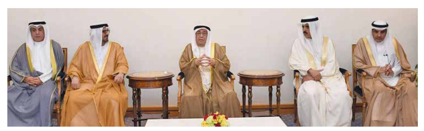
Deputy Prime Minister, Supreme Council for the Development of Education and Training President, His Highness, Shaikh Mohammed bin Mubarak Al Khalifa, with ministers and heads of delegations participating in the 11th Conference of Arab Ministers of Education. The conference also coincides with the celebrations of the establishment of formal schooling hundred years ago in 1919