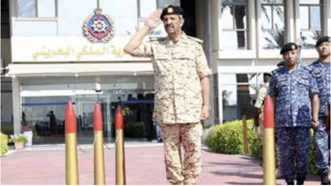
The Commander-in-Chief of the Bahrain Defence Force (BDF), Field Marshal Shaikh Khalifa bin Ahmed Al Khalifa, during an inspection visit to one of the BDF units. The commander-in-chief gave directives to continue implementing various training programmes to achieve the highest levels of combat and administrative readiness

Gulf Air will use an Airbus A320 aircraft to operate three weekly flights between Bahrain International Airport and Erbil International Airport.