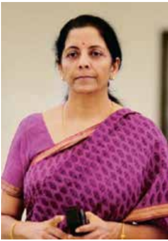
Finance Minister Nirmala Sitharaman

India's cabinet has approved 100 billion rupees ($1.4 billion) for a fund to help clear stalled housing projects, Finance Minister Nirmala Sitharaman said late yesterday. Sitharaman said the State Bank of India (SBI) and state-run insurance company Life Corporation of India will contribute an additional 150 billion rupees, taking the total size of the fund to 250 billion. The new fund, or special window, will help revive more than 1,600 moribund housing projects, Sitharaman said. "The special window would provide funds to stalled housing projects enabling them to complete unfinished projects and consequently ensure delivery of homes to a large number of home-buyers," the minister said. Sovereign and pension funds would also be allowed to con-