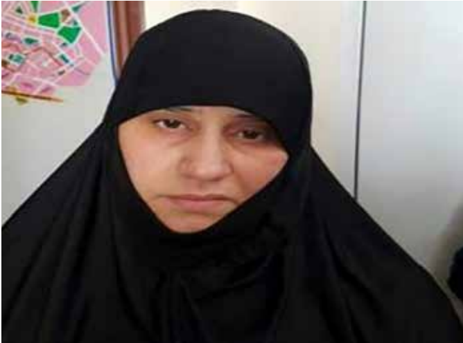
Turkey has revealed that slain Islamic State leader Abu Bakr al-Baghdadi’s wife was captured last year and disclosed details about the jihadist group’s “inner workings”.