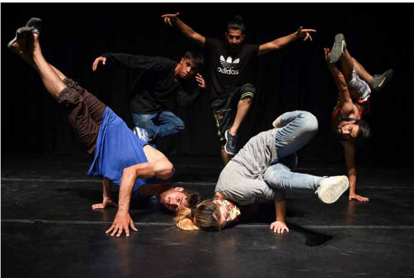
Afghan breakdancers pose for a photograph at the French Cultural Centre in Kabul