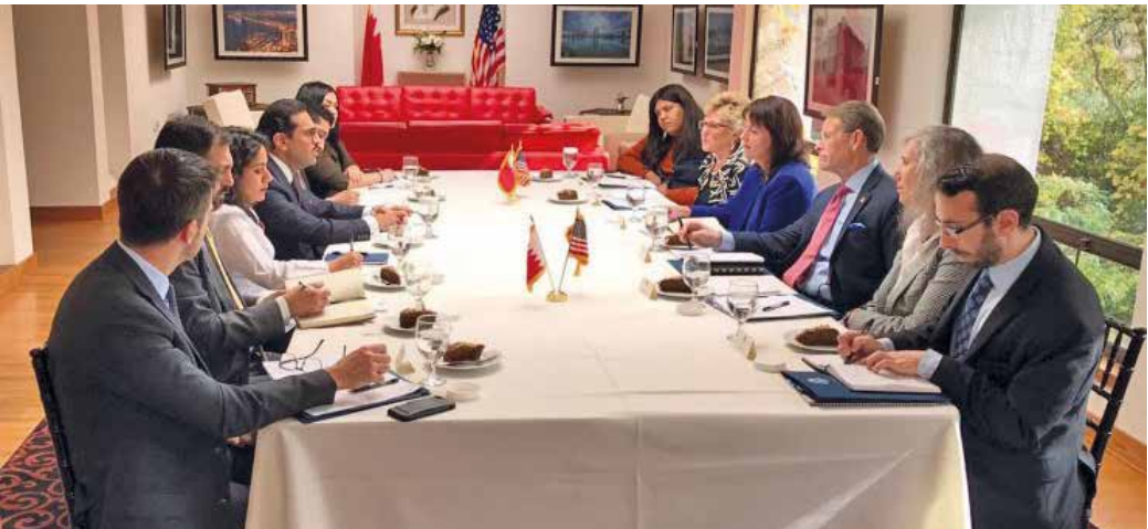
Bahrain's Ambassador to the United States Shaikh Abdullah bin Rashid bin Abdullah Al Khalifa with the Chairman of the United States Commission on International Religious Freedom Tony Perkins and the Committee members accompanying him to learn about the results of their recent visit to the Kingdom. The ambassador expressed appreciation of their visit to Manama and considered it a positive step in identifying Bahrain's pioneering model in peaceful coexistence and consolidation of the values of tolerance, pluralism and citizenship under the comprehensive reform approach of His Majesty King Hamad bin Isa Al Khalifa.

The closure which began yesterday at 11:00 pm will end tomorrow at 03:00 pm.