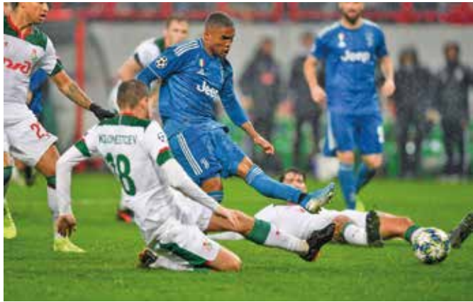
Juventus' Brazilian forward Douglas Costa scores a goal