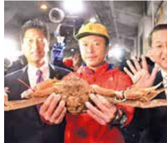
The crab beat the record last year

According to Inamoto, the price exceeded last year's record price of two million yen,