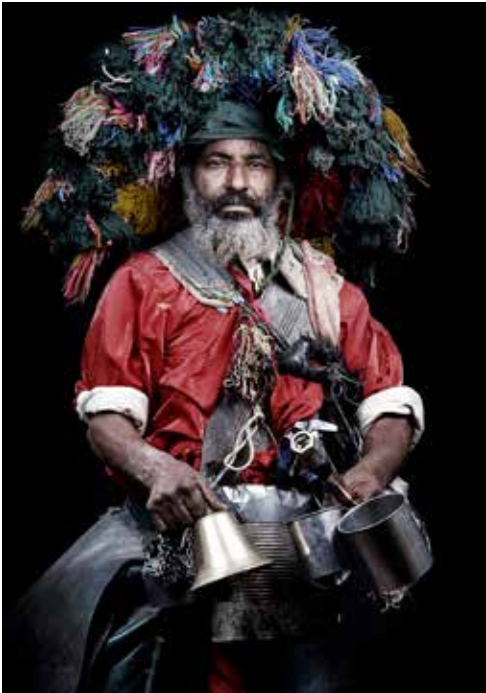
A photo by Leila Alaoui

Leila Alaoui spent the last days of her life working on an assignment commissioned by Amnesty International and UN Women to photograph and share stories of women who triumphantly overcame abusive hardships in Ouagadougou, Burkina Faso