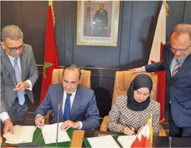
Representatives Council Speaker Fawzia bint Abdullah Zainal yesterday lauded distinguished strategic historical relations between Bahrain and Morocco. This came during an official parliamentary discussion session which convened yesterday in Rabat under the presidency of the Representatives Council Speaker and her Moroccan counterpart Habib Al Maliki. A memorandum of understanding was signed to activate the role of friendship committees and promote bilateral parliamentary cooperation.

A photo gallery held on the sidelines of the conference put the spotlight on the history of education in Bahrain and projects by Bahraini students on digital empowerment and artificial intelligence.