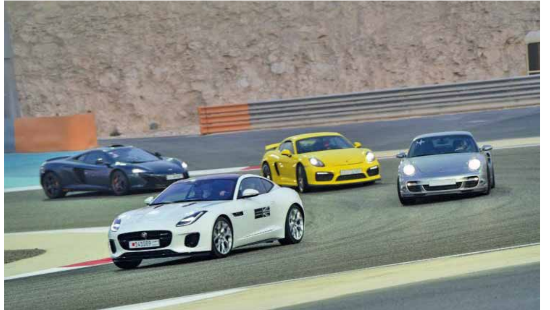
Cars on the track at BIC

The Clio Cup car is a Renault-manufactured racing machine that features a 1.6-litre Turbocharged engine that