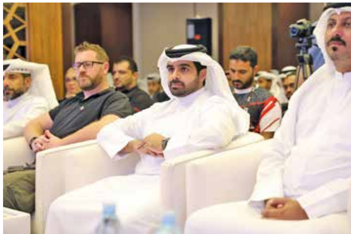
HH Shaikh Salman bin Hamad Al Khalifa during the event