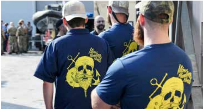
Mine-clearing teams have been used “more than in the past” amid tensions between Iran and the US

phases for staff build-up and training, seminars and table-top discussions, At-sea Fleet Training Exercise and hot-wash and redeployment of forces.