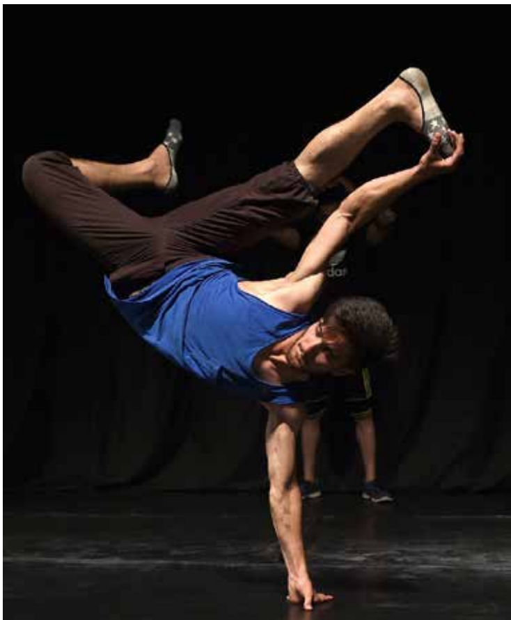
An Afghan breakdancer strikes a pose during a practice session

culture that has gone on to dominate everything from pop music to fashion worldwide in the ensuing decades.