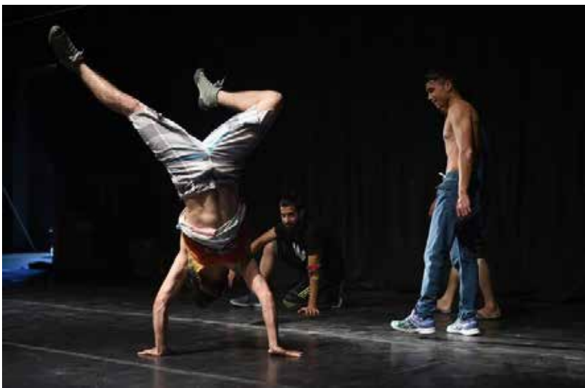
Dancers during a practice session at the French Cultural Center in Kabul

The sport first originated in New York's Bronx borough in the 1970s, where "breaking" along with rap music and graffiti art formed the pillars of hip hop