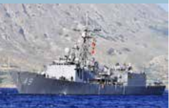
Oliver Hazard Perry-class frigate

The Royal Bahrain Naval Force (RBNF) reportedly have 11 combat vessels, 31 patrol craft, 10 landing ships and over 700 personnel, with RBNS Sabha missile frigate as its flagship vessel.