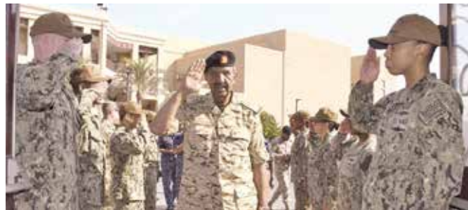
BDF Commander-in-Chief during the inauguration of IMSC centre TDT | Manama

Bahrain Defence Force (BDF) Commander-in-Chief yesterday inaugurated a command centre for the US-led naval coalition, established in response to a series of attacks on oil tankers, within the US Naval Support Activity.