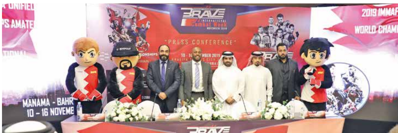
Brave officials during the press meet