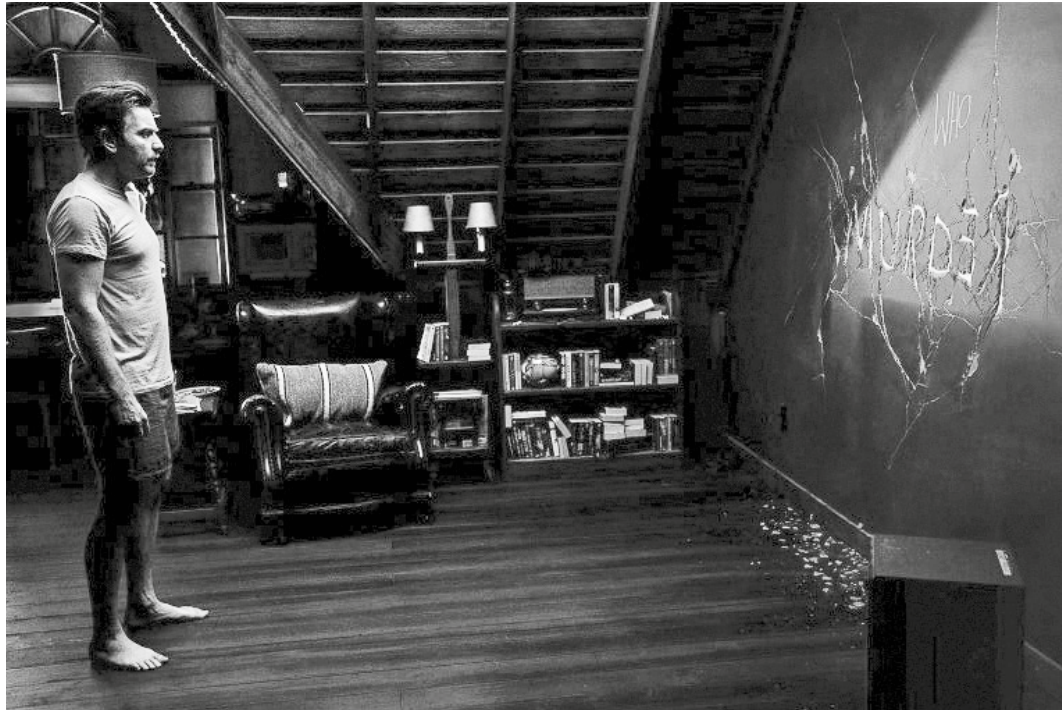
A scene from 'Doctor Sleep'

CIVIL ENGINEER LOOKING FOR JOB A Civil Engineer, proficient in Quantity Surveying, Structural Design, AutoCAD Drafting is seeking an appropriate Job. Do contact on 35549262 or email stephysunny485@gmail.com