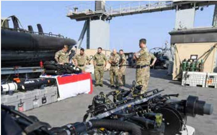
British forces are taking part in the IMX along with 49 other countries