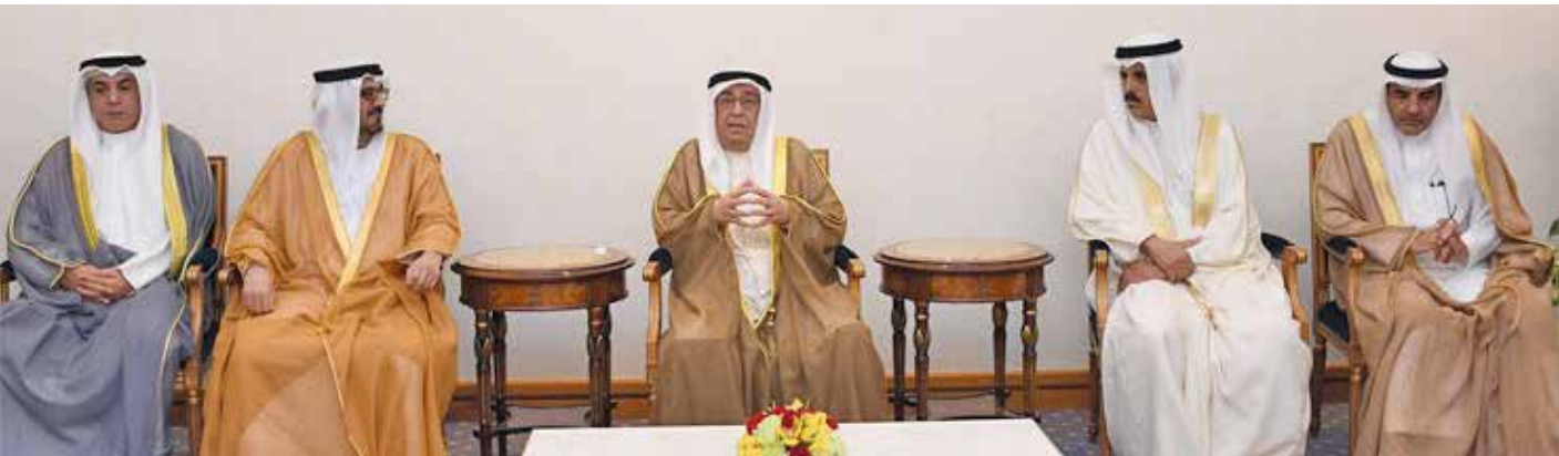
Deputy Prime Minister, Supreme Council for the Development of Education and Training President, His Highness, Shaikh Mohammed bin Mubarak Al Khalifa, with ministers and heads of delegations participating in the 11th Conference of Arab Ministers of Education. The conference also coincides with the celebrations of the establishment of formal schooling hundred years ago in 1919