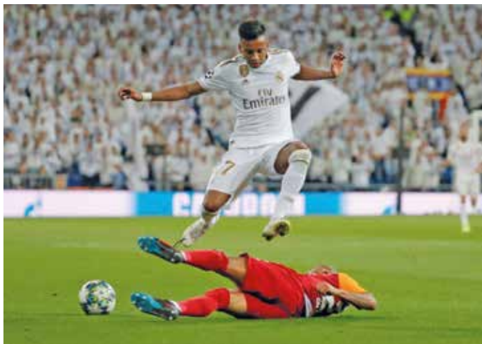
Rodrygo of Real Madrid is tackled by Mariano Ferreira of Galatasaray

likely be at the mercy of the draw when it comes to the last 16 but that is their punishment for a miserable opening defeat in Paris and an equally dispiriting draw at home to Brugge.