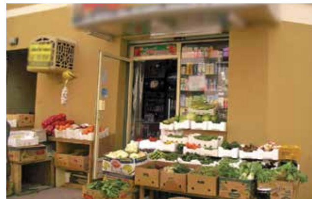
One of the coldstores that was robbed

"All we were told was that two men came in a car, brandished a knife and left with