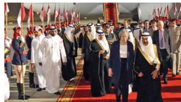
Prince Khalifa receiving Theresa May

The British Prime Minister Theresa May also took time out from the two-day trip yesterday to visit the Khalifa bin Salman Port. "Gulf security is our security," she said, while praising the strategic value of Britain's relations with the Kingdom.