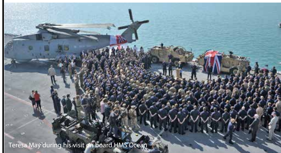
Theresa May during her visit on board HMS Ocean