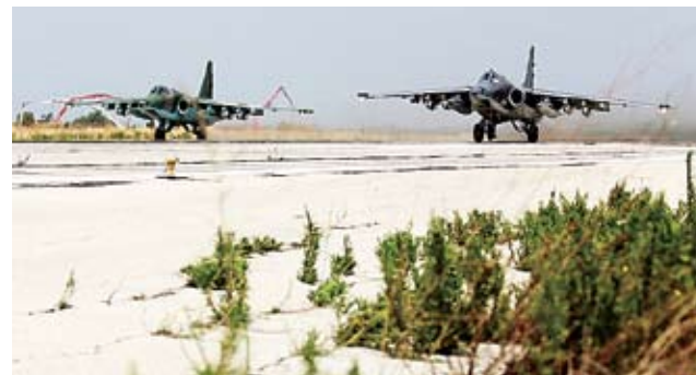
Russian war planes set to carry out attacks in Syria.

butcher Assad, which is a terrible mistake for them and for the world," Cameron told