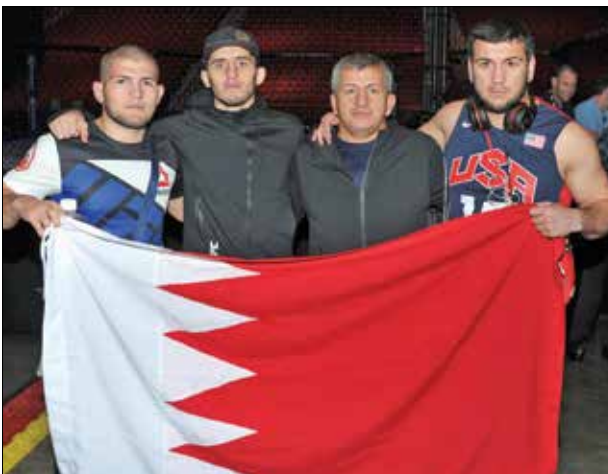
Team KHK MMA

It was also announced that the fight will be covered by 30 international sports agencies, including Bahrain Sports Channel. The top bout of the 13 is between Daniel Cormier of the US who has a 16 wins and one loss record and faces Sweden's Alexander Gustafsson with 16 wins and three losses.