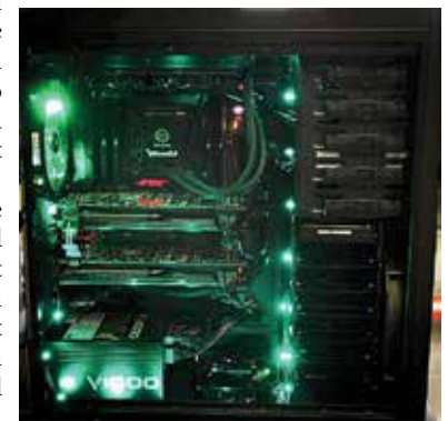
Just look at that beauty!

Thankfully in our day and age there are a plethora of helpful guides on how to build your first rig and how to maintain it in future upgrades and longevity. It is very much like a car, clean it, oil it and service it and I swear to All Mighty God that it will last.