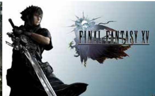
Final Fantasy 15