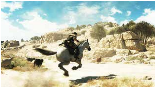
Metal Gear Solid 5: The Phantom Pain